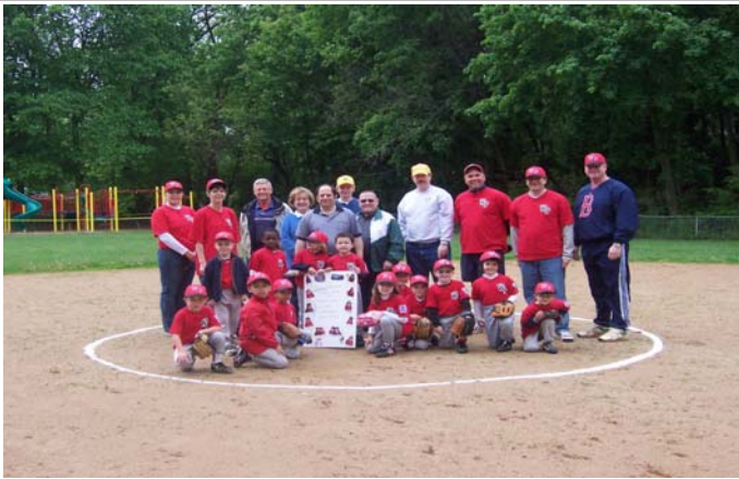
The Wilhelm-Paxtang Athletic Association t-ball team (The Lions) thanks the Paxtang Lions Club for their sponsorship!